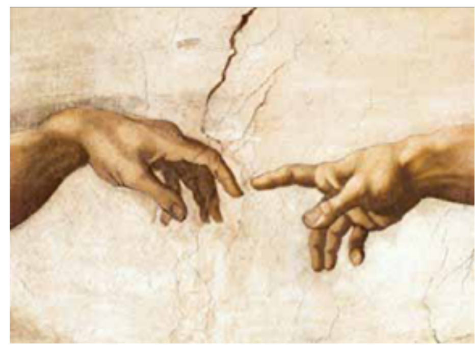
Creation of Adam by Michelangelo, Sistine Chapel