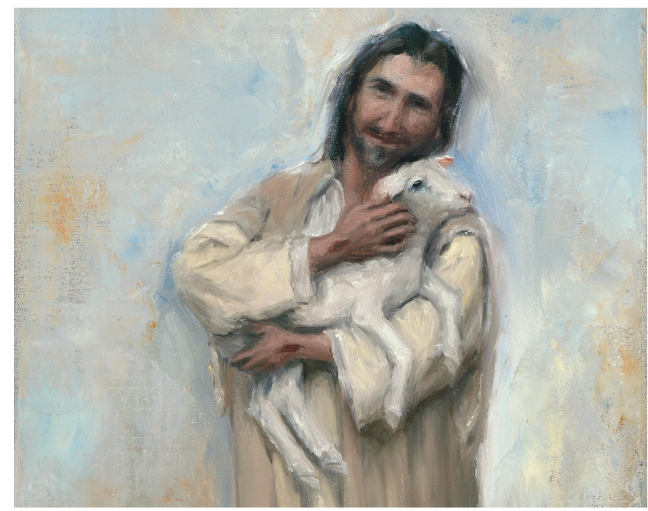
The Good Shepherd - Moran