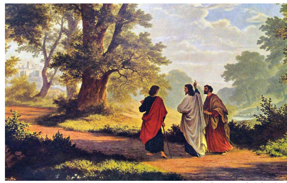
Road to Emmaus by Robert Zund