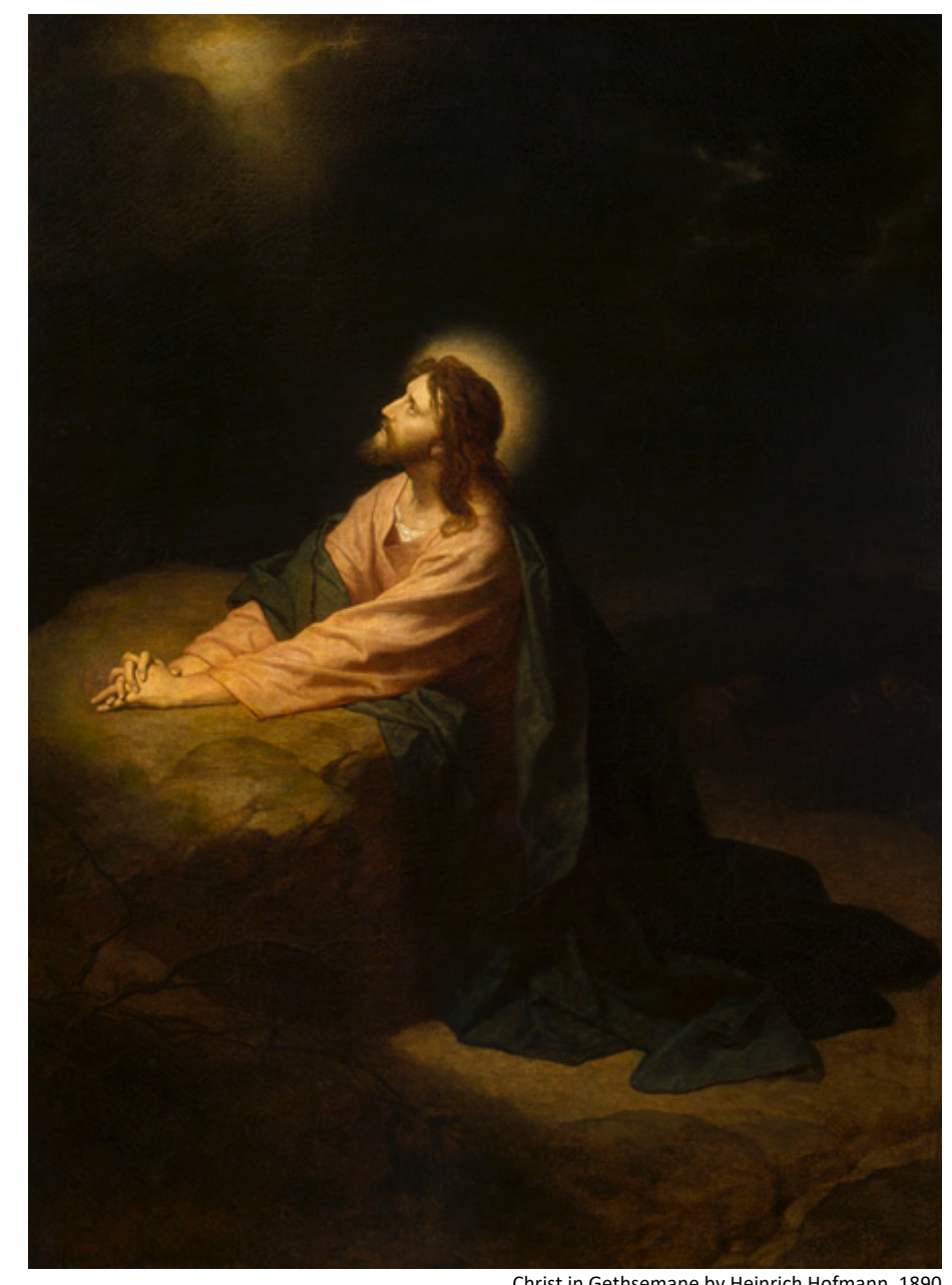
Christ in Gethsemane by Heinrich Hofmann, 1890